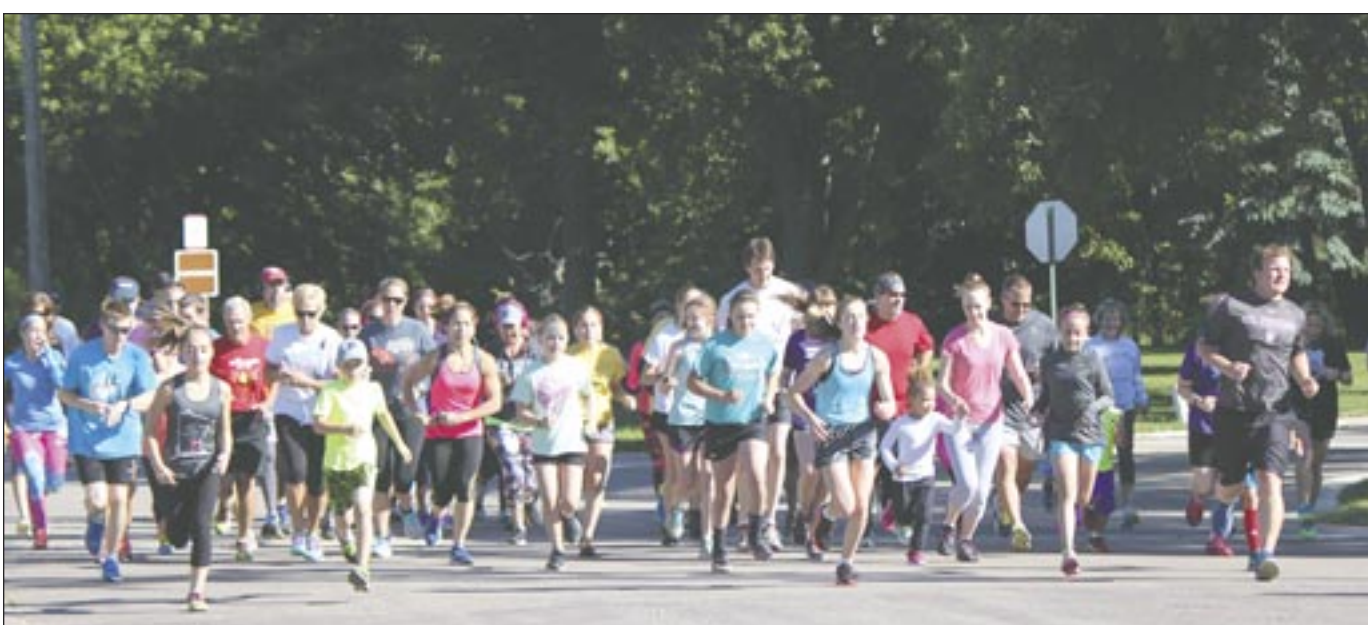
Saturday morning's traditional fun run/walk, sponsored by Glencoe Regional Health Services, again drew a large group of participants.