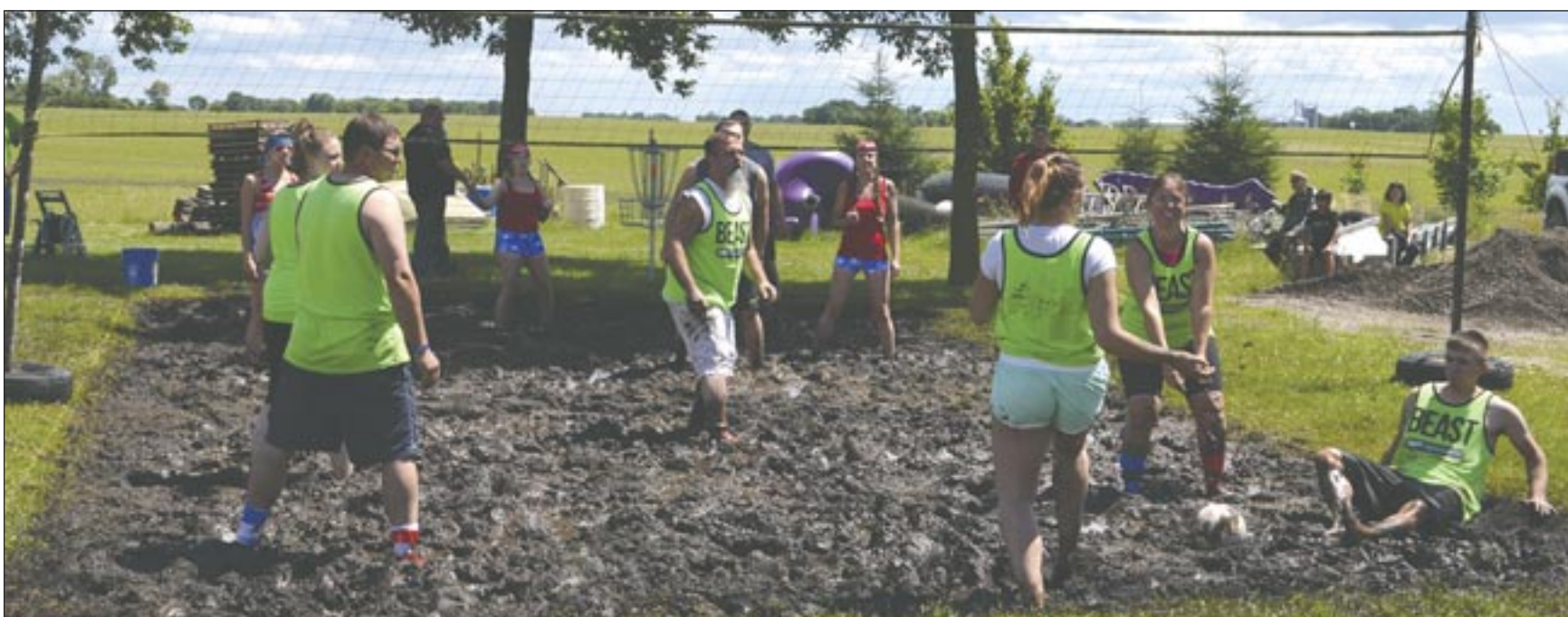
It was a little cool Saturday, but that didn't stop volleyballers from diving into the mud at the mud volleyball tournament. Pictured above is the coordinator "Beast" volleyball team (in the green shirts).