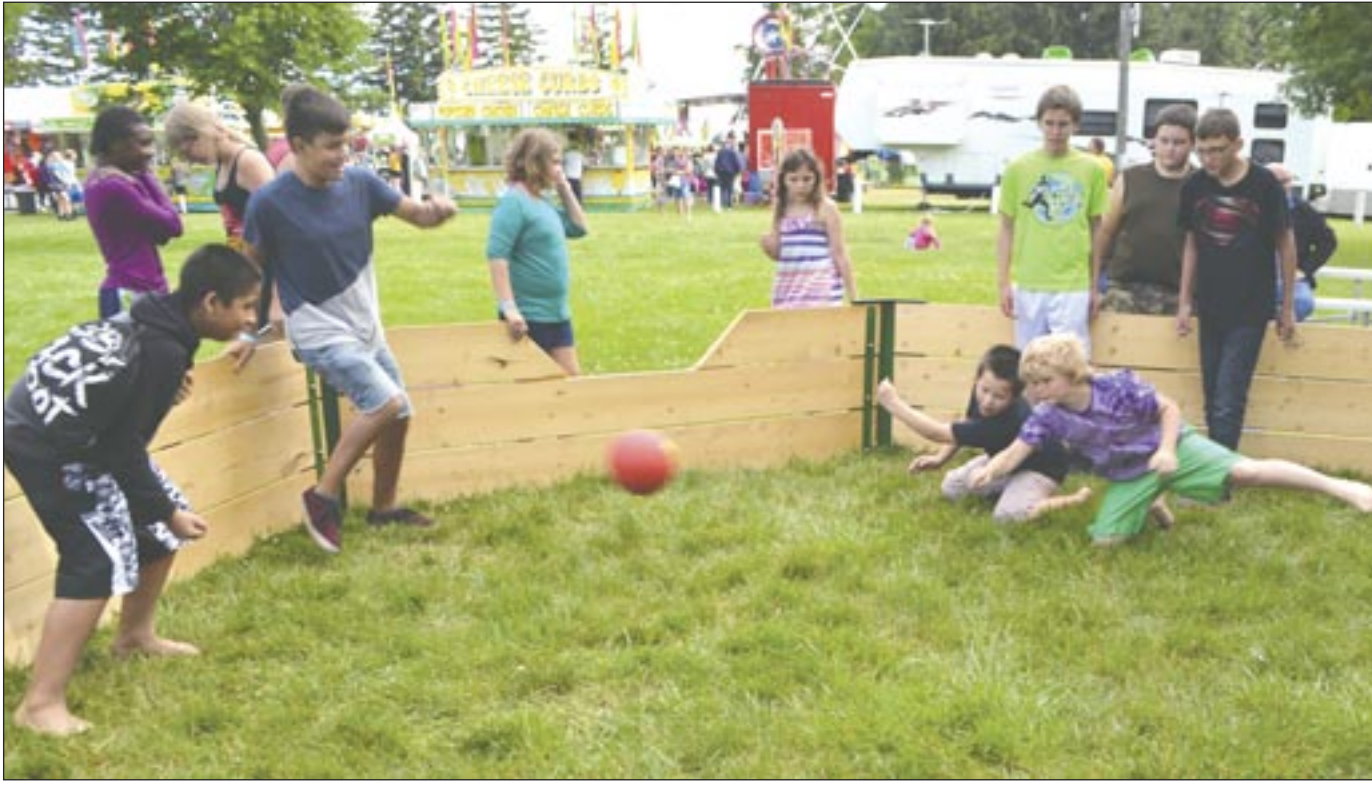
Children of all ages found GaGa Ball to be a real attraction Friday night during the corn feed. The game is similar to dodge ball, but played within an arena and everyone is on their own, rather than on a team.